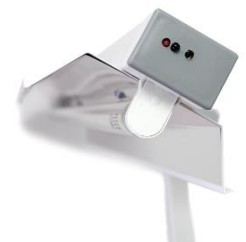
Digital counter with acoustic signalling, without the display